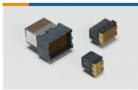
High Speed Backplane Connectors(65)